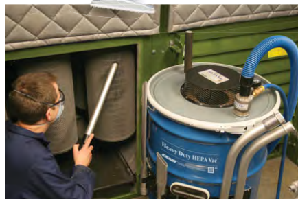
A clogged filtering system for a buffing booth is quickly cleaned and put back into service using the Heavy Duty HEPA Vac.

The Heavy Duty HEPA Vac does not use electricity and has no moving parts, assuring maintenance free operation. This eliminates the risk of electric shock often associated with electric shop vacs. Static resistant hose prevents painful shocks when vacuuming dry, dusty materials.