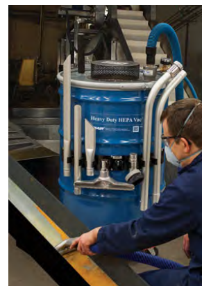
A technician uses a Heavy Duty HEPA Vac to perform scheduled maintenance on a pulverizer.